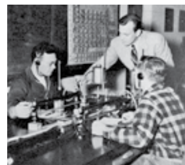
Physics Lab, 1950's