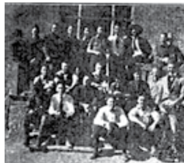
First day of classes, 1920's