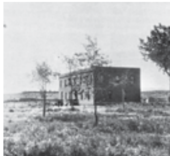
1st Dorm, Driscoll Hall, 1900's