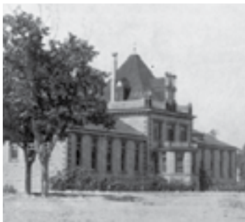
Old Main, 1890's