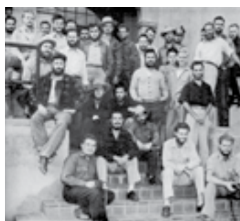
Juniors and Seniors, 1940's