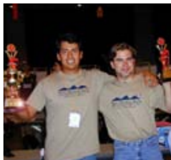
Robotics Contest, China, 2000's