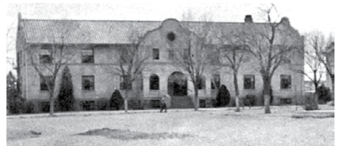
Fitch Hall, 1950

A GEOPHYSICIST!" I did and I never made a better decision. The guy was wrong on both counts (in my case), but I wouldn't trade my life for anything. I married my wife on Friday 13, 1950, and graduated in May. We had enough money for her to take the bus home to her parents place and I bummed a ride to Los Angeles. I didn't get a job until August, so I "bucked" hay in the San Joaquin Valley and rode the trucks down to L.A. to look for work. I got a job with Shell Oil in August. My final position was District Geophysicist. Times were slow so, after 13 years, I quit to go into computer programming. I worked there for