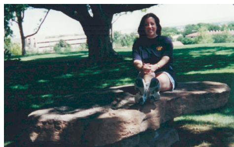
"He hauled in a large table-shaped rock to the front yard where his family gathered for decades to enjoy a picnic and some cold watermelon on a warm summer evening."